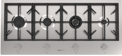
Milano Cooktop 4 burners inLine 7640 900