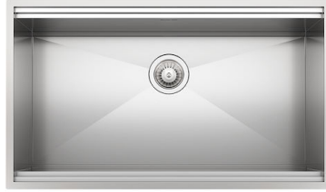
Sink Leonardo 33" x 20" - U/M 1014 660